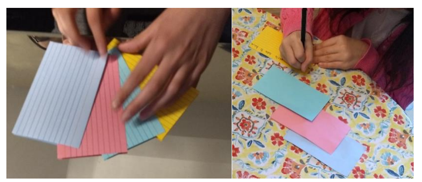
Figure 5: Placing hints face down to turn the hint selection process into a game

Throughout the process and especially in the hinting activities, families incorporated game-like elements to engage their audience. In six families (F3, F4, F5, F6, F9, F10), hints were designed to draw in the audience by building suspense or getting them to ask questions. The grandchild in F10 introduced one of their hints saying, " It's the first day of school. What did the teacher say to everyone? ", and the grandchildren in F6 and F10 placed hints face down to turn selection of stories into a game (figure 5). Story illustrations in five families (F3, F5, F6, F7, F10) included elements designed to get people to ask more in order to hear the story, including small drawings that hint at a larger story.