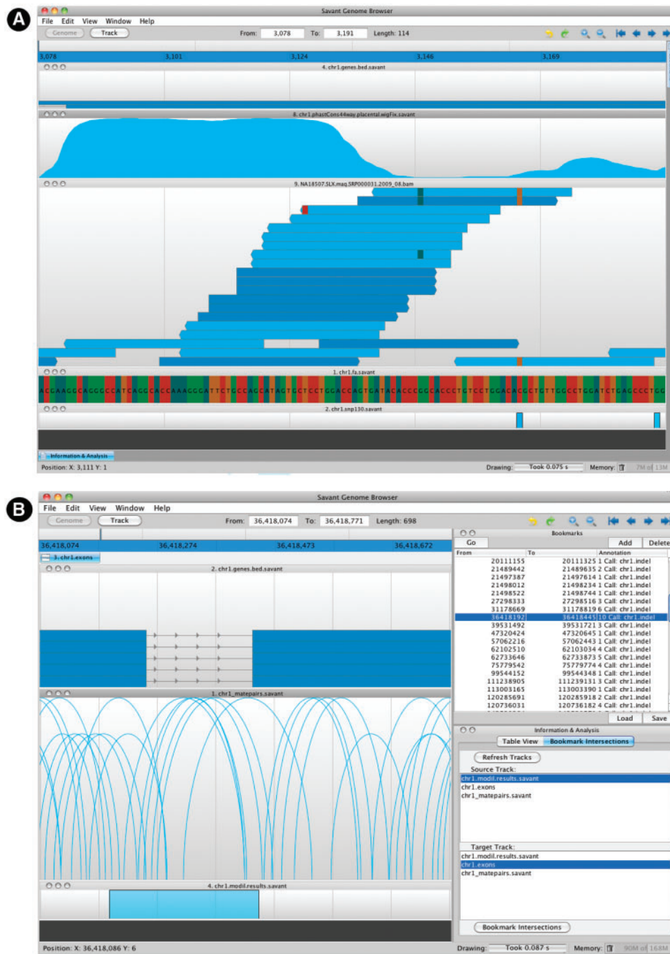
Fig. 4. (A) Visualization of two SNP variants. The displayed tracks are, top to bottom, Conservation, Gene Models, Read Alignments, the Genome sequence and known SNPs from dbSNP. Two potential SNP variants are indicated by consistent mismatching colors within a column, with the downstream SNP previously known, while the upstream one, a heterozygous variant, not in dbSNP. (B) Identification and visualization of MoDIL indel variants that overlap exons via the plug-in framework. The visualized tracks are Gene Models, read mappings (visualized in the matepair mode) and MoDIL predictions. The panel on top right is the Bookmark module, while on the bottom right is the BookMarkIntersection plug-in described in Figure 3. To identify variants of interest, the user selects the two tracks in the BookMarkIntersection window, and those variants that overlap exons are added to the list of bookmarks. The user can then easily go through this list. In this particular case the indel likely occurs in the intron between the exons, but because of MoDIL's inability to accurately identify borders of variants, the variant is shown as overlapping.