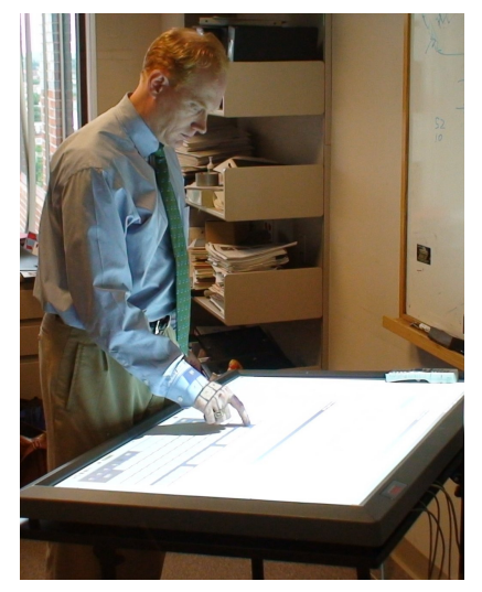
Figure 1. Our participant working at the touch table in his office. The table is his primary computer for everyday office tasks.

The participant, AB, is a marketing executive at a local research lab. The tasks performed on the table are every day office tasks, and are limited to common applications – very little custom software is included in his setup (Figure 1). AB's use of the tabletop is motivated primarily by his work: his role is the marketing and sale of the touch table. The system driving the table is AB's laptop, which he also uses on the road and at home, not connected to a touch table. This pairing of input devices has allowed us to perform some simple comparative statistics on table and desktop use.