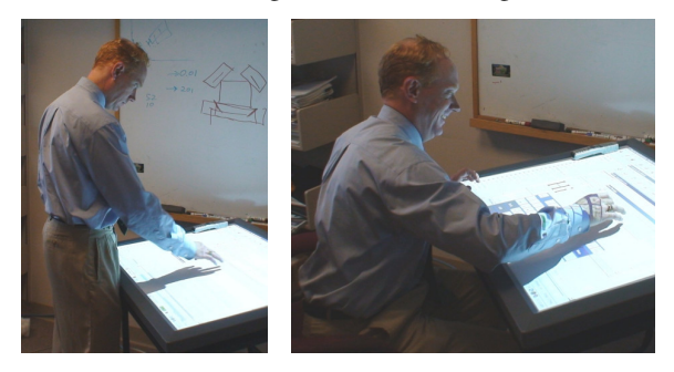
Figure 2. The touch table is oriented as a drafting table. Its height is set for both standing and sitting.

The DiamondTouch is mounted on a sloped surface, creating a drafting table style of interaction. As shown in Figure 2, the height of this was set so as to allow AB to use it while standing (left) or seated (right).