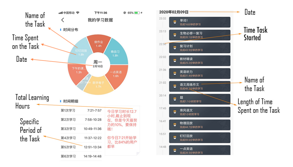
Figure 4: Duration of Learning Activities. Left: a summary of P15's tasks and corresponding learning duration on February 10th; Right: a record of the names of specific tasks and the amount of time P15 spent on each task.

layout... I can't accept that my notes are disorganized" (P15). Additionally, P22 expressed that she intentionally captured the dense text or thickness of accumulated test paper to showcase her authentic and intuitive learning outcomes, i.e., "the dense words on the paper or the thickness of piled papers are quite intuitive, creating a