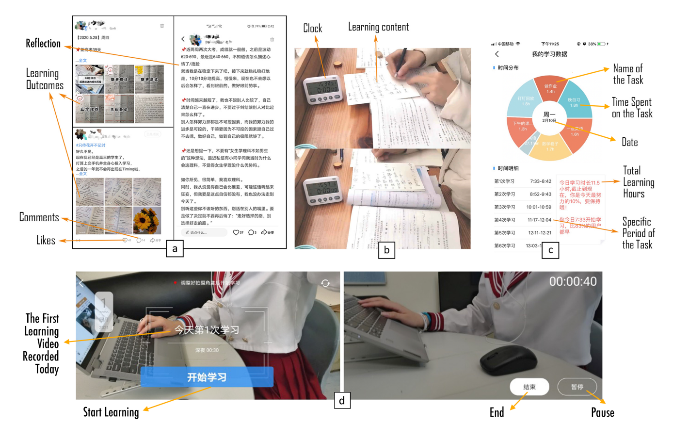
Figure 1: Examples of Timing usage: (a) Users shared every aspect of learning in learning diaries, (b) Users recorded their learning process in the form of learning videos by using the front-facing camera on their mobile devices, (c) Timer, which calculated the time users spent on a specific task. Users could label the name of a task, and (d) Learning video recording interfaces.

students fell behind in the class through LADs could result in negative emotions [46]. Since this line of research mainly focused on the sensemaking of learning data within a computer-based context, it remains unclear how students make sense of data about non-classroom and non-computer-based learning activities, as well as the types of challenges they encounter during the process of sensemaking. The present research was thus motivated to fill these research gaps.