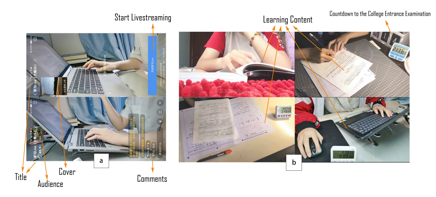
Figure 3: Video recordings that captured the learning process. (a) Live streams delivered by users; (b) Learning videos recorded by the users. These included learning activities and the surrounding environment.