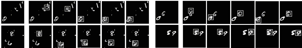
Figure 2: Left) Two examples of the learned policy on the digit pair classification task. The first column shows the input image while the next 5 columns show the selected glimpse locations. Right) Two examples of the learned policy on the digit addition task. The first column shows the input image while the next 5 columns show the selected glimpse locations.

As suggested in Mnih et al. (2014), classification performance can be improved by having a glimpse network with two different scales. Namely, given a glimpse location l_n , we extract two patches (x_n^1, x_n^2) where x_n^1 is the original patch and x_n^2 is a down-sampled coarser image patch. We use the concatenation of x_n^1 and x_n^2 as the glimpse observation. “foveal” feature.