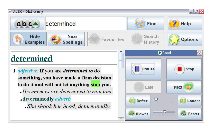
Figure 2: Dictionary look-up with audio spelling.

language-based tools (Figure 1), it aims to not only support classroom exercises and homework but also other non-curricula activities such as reading the newspaper, interpreting a safety notice posted in a public space, writing a letter, and filling-in documents at home.