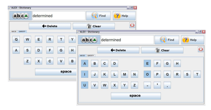
Figure 3: Alphabetic and QWERTY text input.

The main feature of ALEX© is the look-up of definitions in the installed dictionary (Figure 2), with word usage examples shown under each definition<sup>1</sup> (which users can turn off or on.) User-adjustable text-to-speech assists learners in reading definitions or in having the button labels being read to users. Words can be entered through either a QWERTY or a vowel-aligned virtual keyboard (Figure 3), with assistance provided by a spelling suggestion function (Figure 4). A persistent favourites-type list (Figure 5) and non-persistent history list implement web browsers metaphors that most users are familiar with. Other resources of the installed electronic dictionaries can also be accessed, such as synonyms or antonyms (Figure 6). An intuitive wizard-like process guides learners through a pronunciation practice figure (Figure 7) that provides positive reinforcement messages ("you did great", "try again, you're still doing great", etc.), based on the correctness of their pronunciations as determined by a customized speech recognition system.